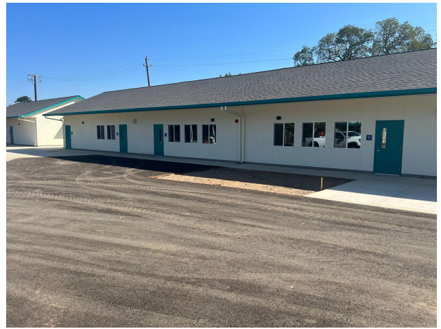
Jackson Heights classrooms and restroom.