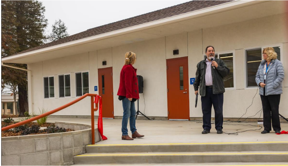
Ribbon cutting at Metteer Elementary School, , December 2022