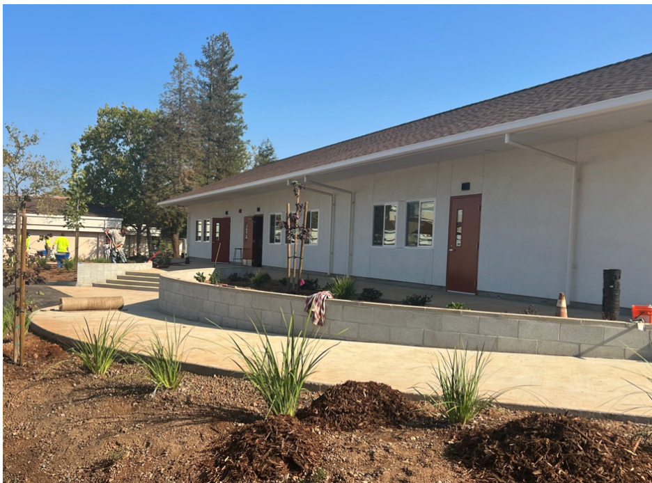
October 2022 construction progress of Metteer Elementary School's new classrooms.