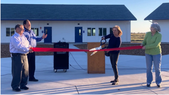
Ribbon cutting February 2022