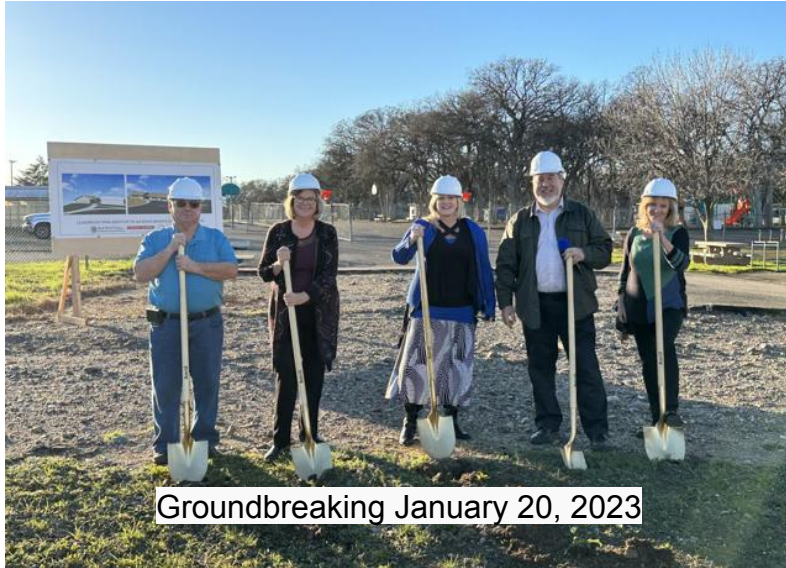
Groundbreaking January 20, 2023