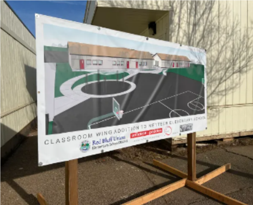
Design of the new classrooms at Metteer Elementary School